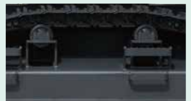
2 Large, double-support, outer flanged upper rollers