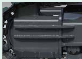
1 Reinforced guide frame

The crawlers are designed to provide unbeatable durability to take on the harshest terrain. They feature full track guides to eliminate de-tracking concerns, a reinforced guide frame built to withstand heavy impact, and large, double-support, outer flanged upper rollers unfazed by powerful vibrations.