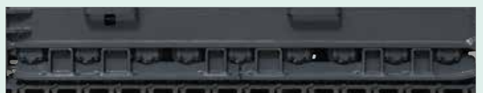
3 Full track guide